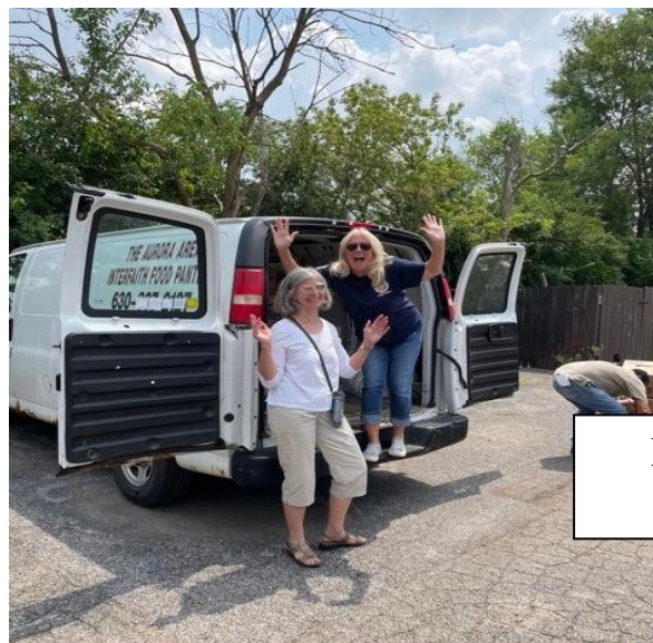
Pop-up Pantry Delivery Site